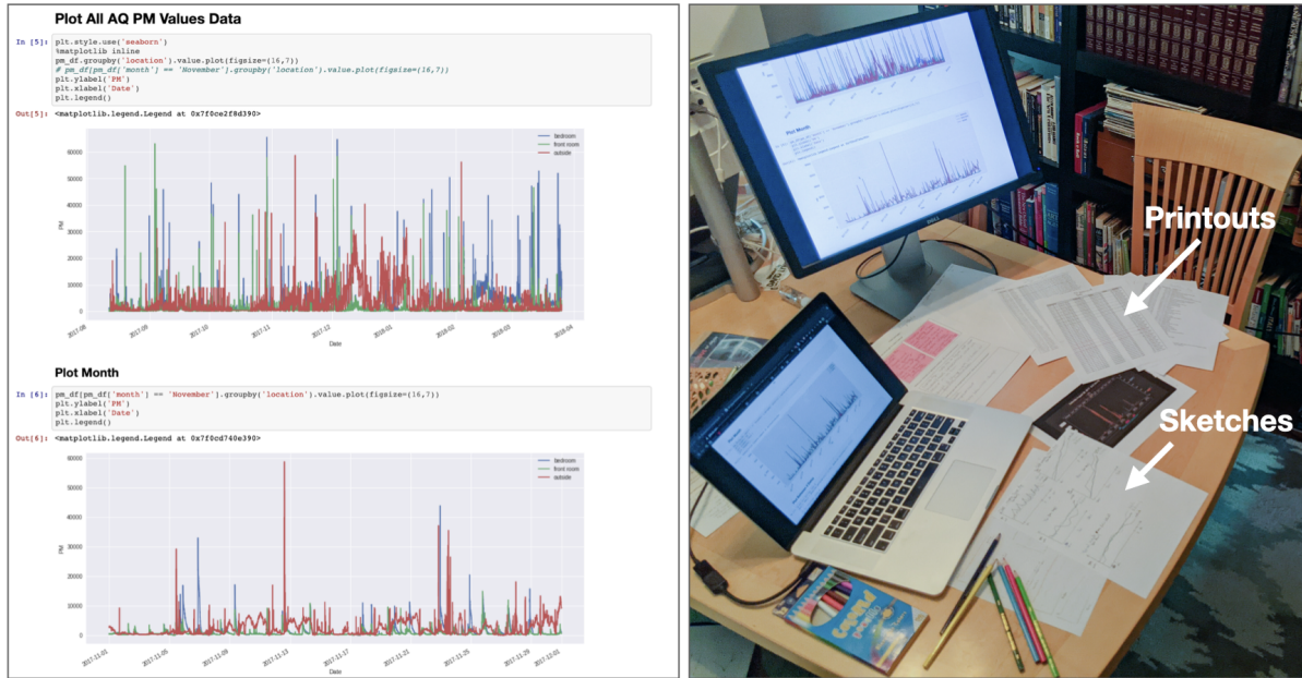
Fig. 3. Left: A screenshot of the data analyst’s Jupyter notebook used to process and display participants’ data. This view was mirrored between the analyst’s laptop and external monitor when presenting data to participants. Right: A typical data engagement interview setup. Interviews included physical printouts of a participant’s data to help them to understand what data was available. Some participants also used sketching to communicate how they imagined using their data to the interviewers and data analyst.